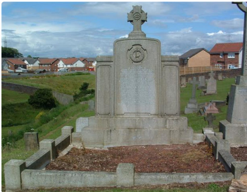
Family Plot in Airdrie (St Josephs) RC Cemetery