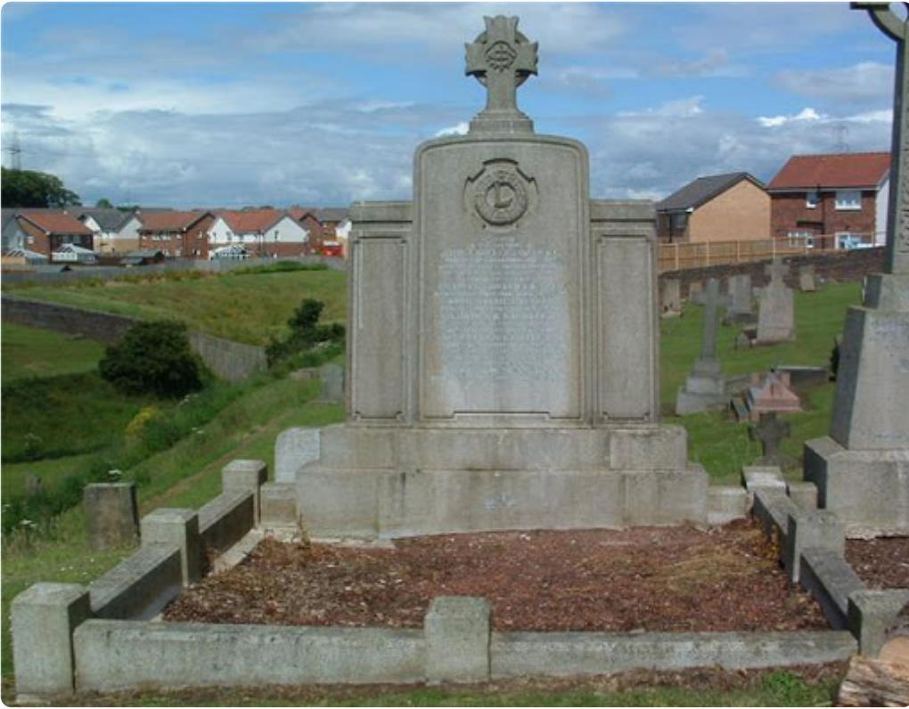
Family Plot in Airdrie (St Josephs) RC Cemetery