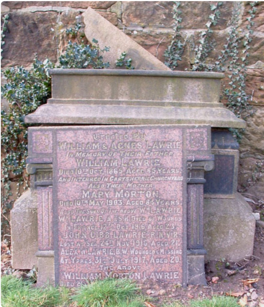
Family Plot in Old Monkland Cemetery (1)