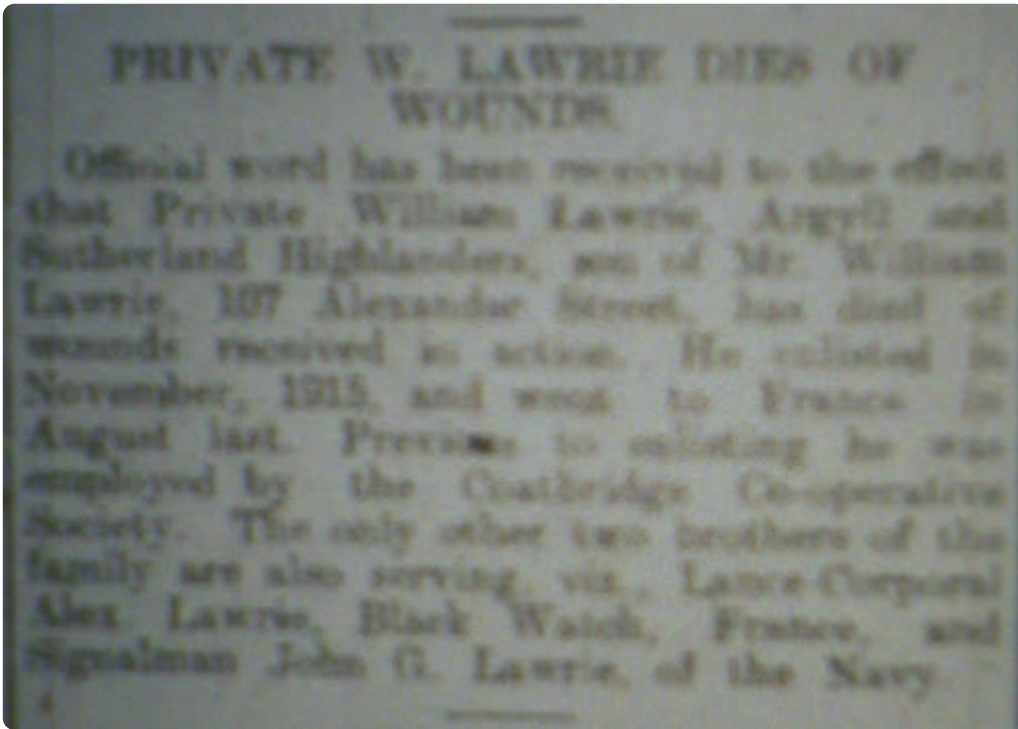
Airdrie and Coatbridge Advertiser 04/11/1916