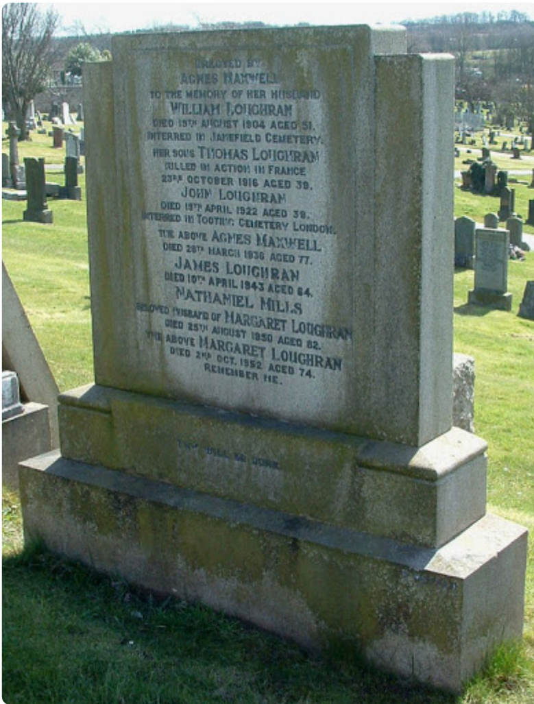
Family Plot in Old Monkland Cemetery