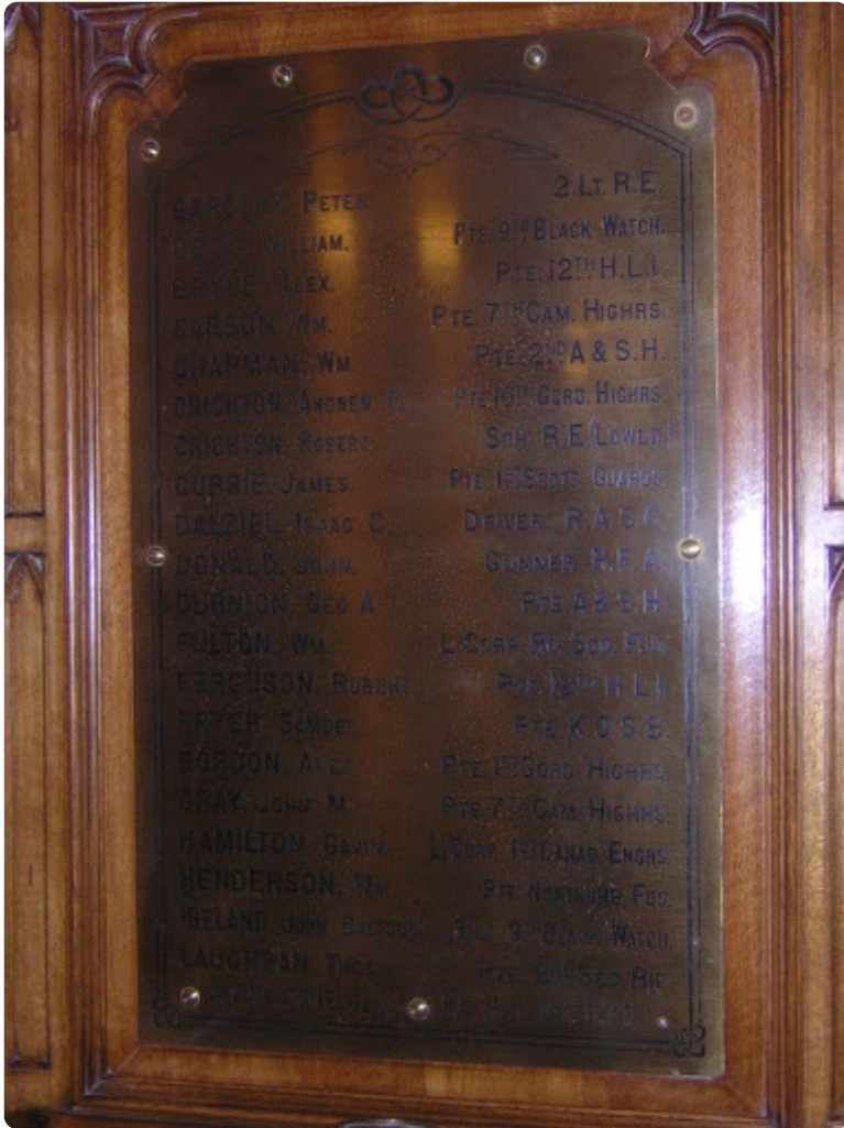
Gartscherrie Church Roll of Honour