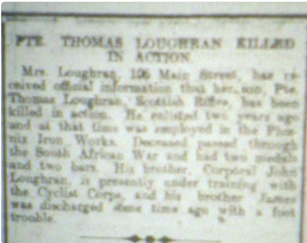
Airdrie and Coatbridge Advertiser 18/11/1916