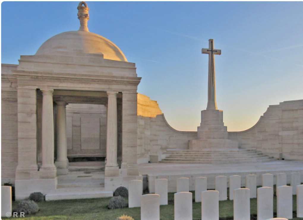
Coatbridge Express 27/10/1915