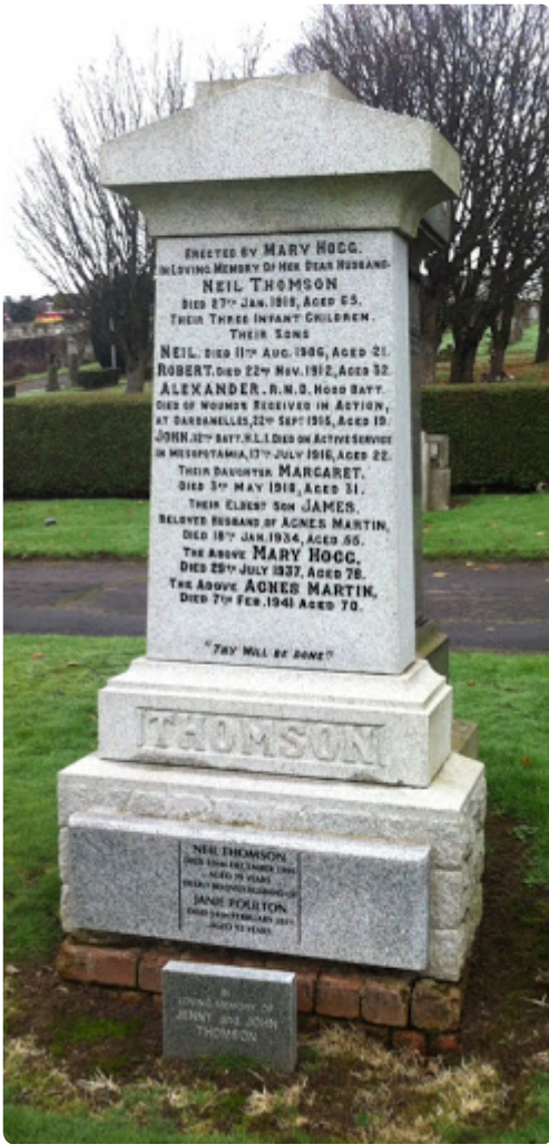
Alexanders name on the Family Plot in Old Monkland Cemetery (1)