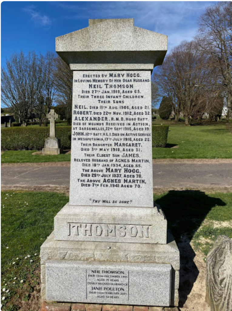
Alexanders name on the Family Plot in Old Monkland Cemetery (3)