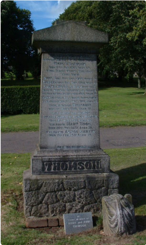
Johns name at the Family Plot in Old Monkland Cemetery (1)