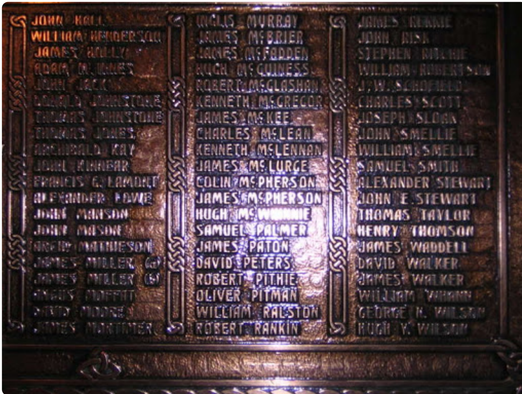
Maxwell Parish Church Roll of Honour