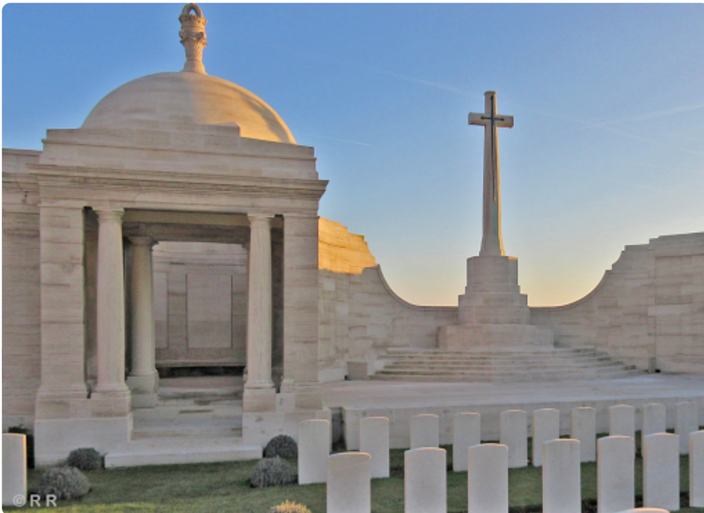
Coatbridge Express 27/10/1915