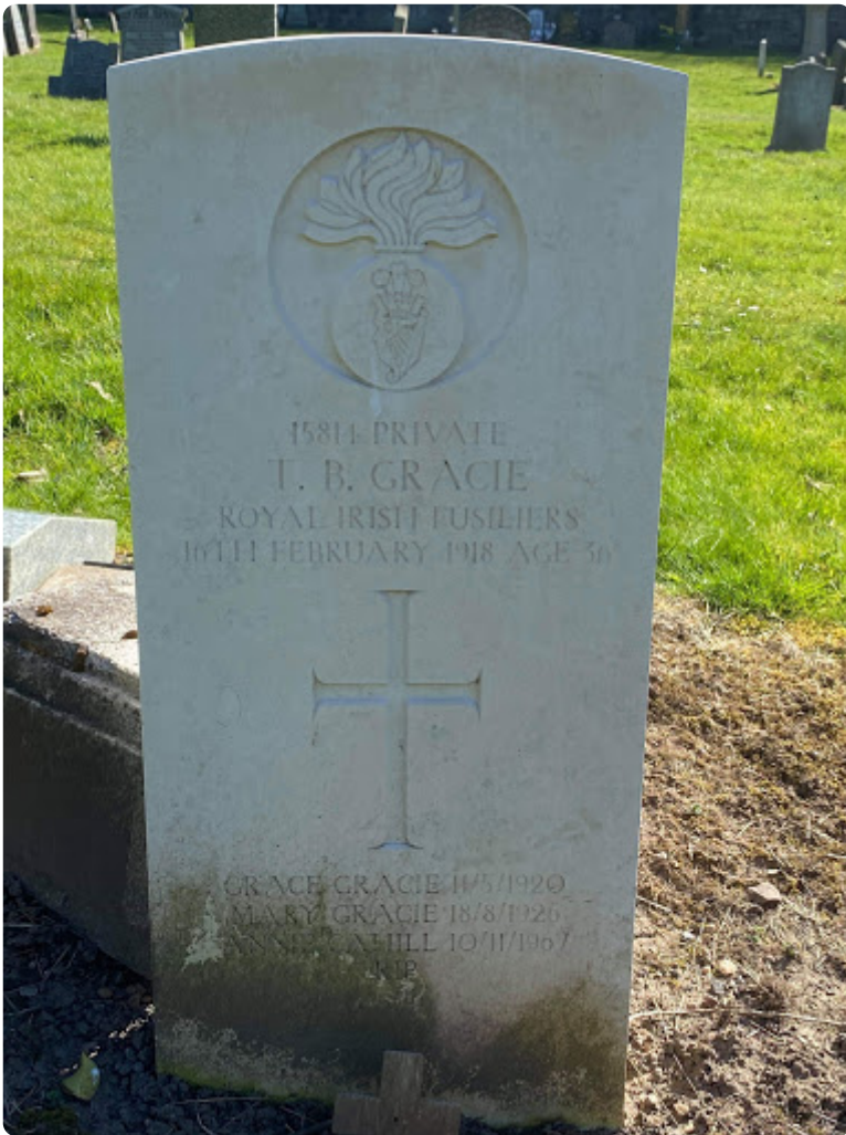
Theodore's Headstone in Old Monkland Cemetery