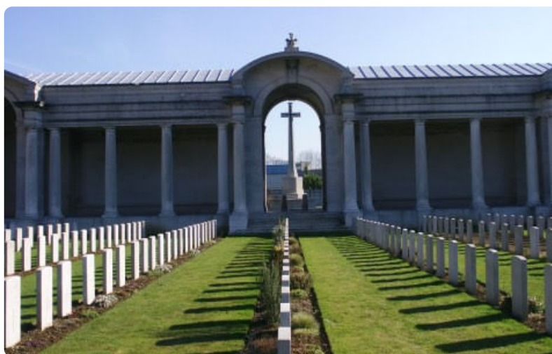
Buried/remembered at Arras Memorial (Bay 6), Pas de Calais, France