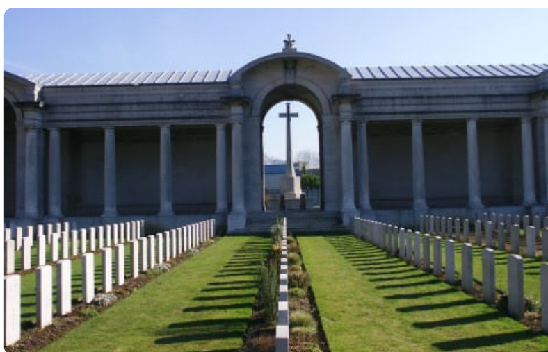
Buried/remembered at Arras Memorial (Bay 6), Pas de Calais, France